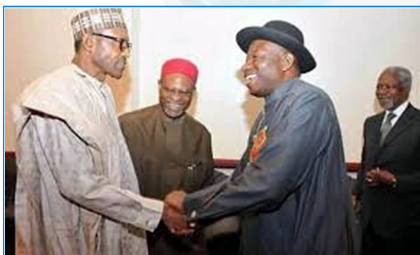
Peace Accord

line with international standards; Political actors maintain their steadfastness to violence-free elections as contained in the January 2015 Peace Accord 4 signed in Abuja ( less likely )