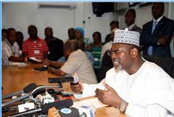
Jega postpones elections

The rescheduled elections have come under heavy criticisms by Nigerians and the international community given the enormous human, financial and material resources already committed towards the conduct of the elections. The criticism was on the possible political undertone of the postponement, a position expressed by eleven political parties allied together under Coalition of Progressives Political Parties who expressed disappointment with the decision by INEC to reschedule the general elections by six weeks. The main opposition party All Progressive Congress (APC) also condemned the shift but however called upon its supporters to remain calm. On one hand, some have argued that given the threats posed by Boko Haram, the postponement is a logical decision. Proponents of this thought holds that were elections to hold in the northeast and are inconclusive; the nation and INEC would have to deal with the issues of credibility, which could also pose a real challenge for the country. While the critics of the postponement argued that the postponement lacks basis because the military have been unable