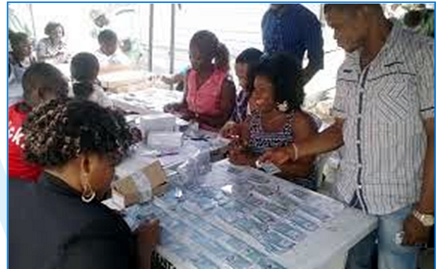
Citizens Collecting PVC

expected to proceed on 3 months terminal leave by or around March 1 in compliance with civil service regulations. This development is