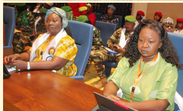
WANEP, represented by its National Network Coordinator for Burkina Faso, at the regional dialogue of the AES Expert Working Group.