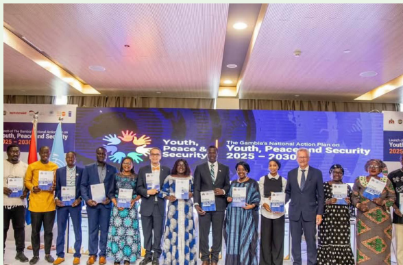
WANEP provided technical advisory support for the development of The Gambia's YPS National Action Plan.

Across West Africa and the Sahel, WANEP provided sustained technical support to Member States to advance the development and domestication of National Action Plans on Youth, Peace and Security (UNSCR 2250). Seven countries comprising Benin, Ghana, Senegal, Sierra Leone, Mali, Niger and Togo received technical assistance for the development of YPS NAPs, while The Gambia and Liberia were supported to domesticate their YPS frameworks. As a result of these engagements, The Gambia and Liberia successfully finalised and officially launched their National Action Plans, marking a significant shift toward institutionalising youth inclusivity in national peace and security architectures.