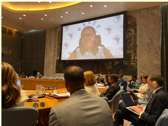
WANEP Executive Director briefs the UNSCR on the WPS Agenda.

At the international level, WANEP reinforced its role as a trusted civil society interlocutor on the Women, Peace and Security (WPS) agenda by briefing the United Nations Security Council on 7 August 2025, during the Council's 9974th. It presented persistent gaps in the implementation of the WPS agenda across West Africa and the Sahel. WANEP advanced concrete, prevention-oriented recommendations, including sustained and flexible financing for women-led peace initiatives, strengthened women's economic empowerment through land rights, access to finance and vocational training, and an increased focus on preventive diplomacy. The engagement contributed to informed discussions on peacebuilding and conflict prevention at the international level.