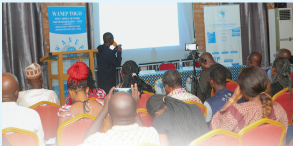
WANEP presents the 2023–2024 biennial security report of NEWS-Togo at a press conference

At the national level, WANEP demonstrated the operational value of early warning data for policy engagement and public accountability. In Togo, WANEP facilitated a multi-stakeholder press briefing to present the 2023-2024 biennial security report derived from NEWS data. The dialogue convened government institutions, international partners, civil society and media actors, resulting in actionable recommendations to strengthen national responses to violent extremism, improve coordination among defence and security actors, enhance community awareness on conflict resolution and sexual and gender-based violence, as well as reinforce rapid response mechanisms.