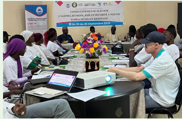
WANEP supports the development of Senegal's National Action Plan on Youth, Peace, and Security.

WANEP also served as a technical member of eight National YPS Working Groups in The Gambia, Liberia, Benin, Ghana, Senegal, Niger, Mali and Sierra Leone, providing technical assistance to stakeholder mapping, capacity strengthening on UNSCR 2250, inclusive consultations, and NAPS-YPS process design. Its collaboration with the National Youth Authority and other key institutions in Ghana, contributed to the development of a National Youth Action Plan. Collectively, these interventions enhanced the credibility, inclusiveness and policy relevance of Youth, Peace and Security frameworks across the region.