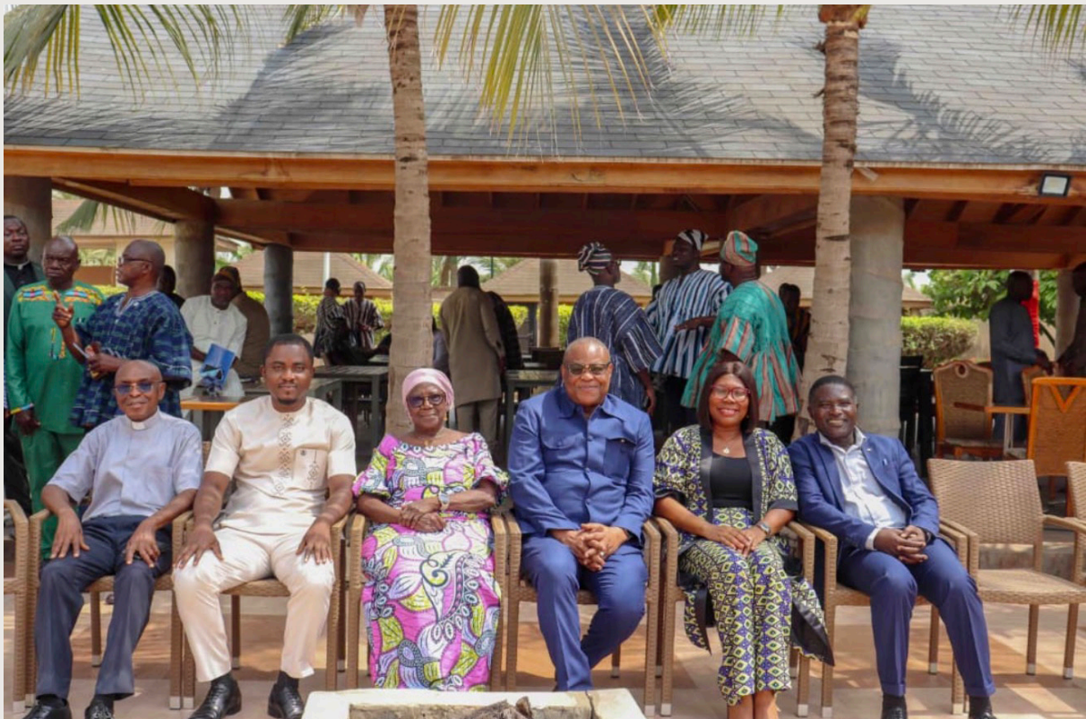
Some Members of the Committee

In response to the violent land conflict in Gbenyiri in the Savannah Region, the Government of Ghana, through the Ministry of the Interior, nominated WANEP to serve on a seven-member mediation committee with the responsibility to facilitate dialogue, promote reconciliation, and support the return of displaced persons following the escalation of the land dispute on 23 August 2025 in the Sawla-Tuna-Kalba District. The recognition and nomination of WANEP to the mediation committee on 8 September 2025 is a reaffirmation of the central role of WANEP in national peace efforts.