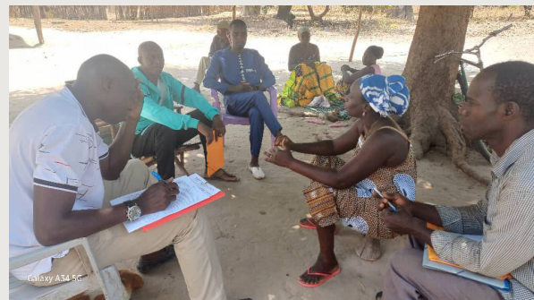
WANEP-GB maps Income-Generating Activities beneficiaries and cattle theft victims as part of the cross-border cattle rustling project

Along the Senegal-Guinea-Bissau border, WANEP applied its institutional expertise in peacebuilding and conflict prevention to address cross-border cattle rustling through community-led interventions. Drawing on its experience in early warning and inclusive security governance, WANEP conducted a field survey that identified women and young people as among the most affected by cattle theft, which informed targeted economic empowerment and conflict prevention actions. Women- and youth-led management committees were established in six border regions, operating in close collaboration with local authorities to strengthen accountability and institutional anchoring. With support from the Ministry of Agriculture, Livestock and Food Sovereignty in Senegal, WANEP facilitated the launch of cattle theft early warning campaigns in Saré-Sissao (Kolda), Sathioum (Sédhiou), and Adeane (Ziguinchor). The provision of ear tags, equipment, and training strengthened livestock identification, traceability, and recovery, while the training of 15 community monitors supported improved reporting and cross-border coordination.