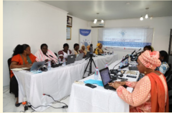
Regional Joint Preparatory Meeting with women leaders from Burkina Faso, Mali, and Niger in Accra, Ghana

As part of its commitment to inclusive governance in the Sahel, WANEP convened a Regional Joint Preparatory Meeting with 20 women leaders from Burkina Faso, Mali and Niger. The regional initiative aimed at enhancing women's leadership and participation in local governance through coordinated and strategic implementation approaches.