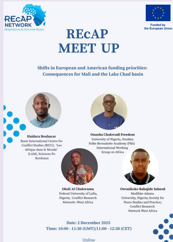
Digital poster announcing an upcoming REcAP Meet-Up