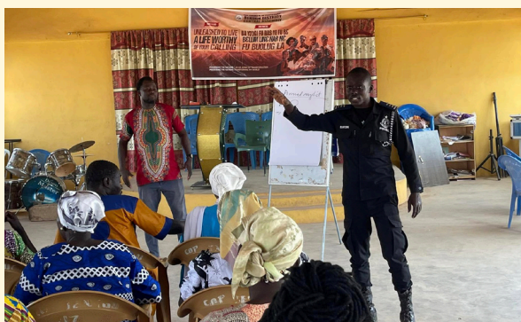
Training on illicit economies and trade impacts with state agencies, youth, and women from Kugri, Siisi, and Danegu border communities in Ghana.

Under the UNDP/UNFPA Peacebuilding Fund project on enhancing social cohesion, WANEP trained 561 women across 24 communities in eight districts of the Upper West, Upper East and North-East Regions