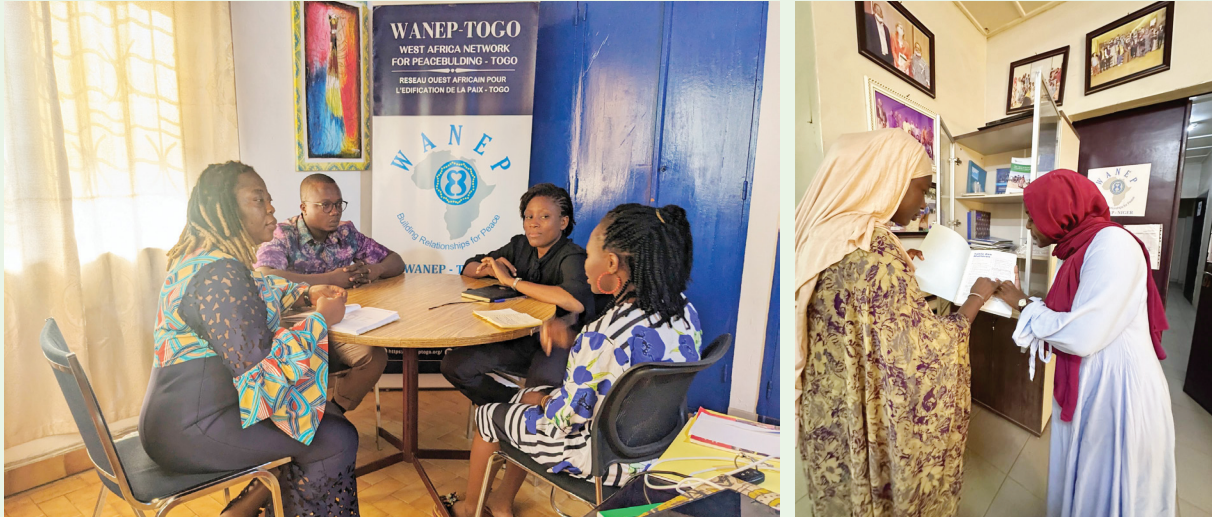
(L-R) YTEaM mentees on their first day of internship at the WANEPTOGO national offices in Togo and Niger.

“Y-TEaM was a truly transformative experience for me. The programme went beyond theory, connecting learning directly to the real political and social challenges facing countries such as my own, Guinea-Bissau. It helped me understand how peacebuilding organisations operate in practice and how youth engagement, partnerships, and ethical leadership contribute to sustainable peace. I came to see that lasting peace in West Africa and the Sahel depends on meaningful youth inclusion, community-based conflict prevention, effective early warning systems, and regional cooperation — with young people recognised as strategic actors for peace.”