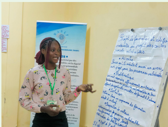
A participant at the 'Promoting Peace for and by Young People' (PPJ) hackathon in Burkina Faso

Complementing school-based peace education, WANEP supported youth-led innovation through the Youth4Peace network by equipping 30 young people, including 15 girls, with project design skills and training on how to present their ideas to potential supporters. This process led to the development of 13 peace projects and the implementation of five funded initiatives. These included digital peace campaigns reaching 500 young people, an arts-based peace day in a secondary school, mediation and conflict-management training for youth, and the creation of two digital applications, which together engaged more than 400 young people.