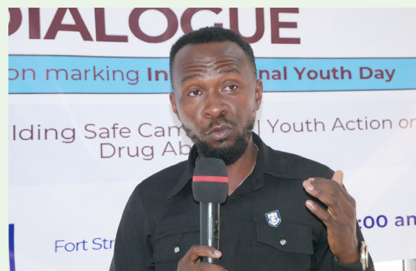
WANEP Sierra Leone's National Coordinator speaks at the drug-free universities roadmap event

In Sierra Leone, WANEP contributed its expertise to a youth-centred joint roadmap that outlines concrete actions to strengthen campus security, promote prevention education, and institutionalise youth-led advocacy through a National Student Task Force, reinforcing youth participation, social stability and preventive peacebuilding. To achieve this result, a youth dialogue roundtable approach was utilised with the participation of student leaders, government institutions, as well as drug enforcement agencies.