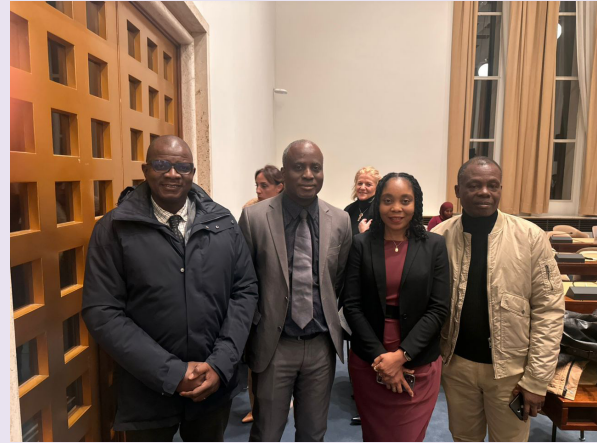
WANEP at the 3 rd Annual CSO-UN Dialogue on Peacebuilding, Geneva, Switzerland