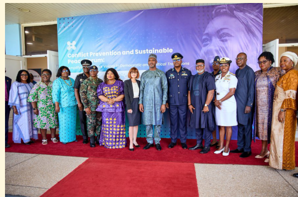
A cross-section of participants in the discourse on Amplifying Women's Voices in Democratic Transitions .

In partnership with the Australian High Commission in Accra, Ghana, and the Kofi Annan International Peacekeeping Training Centre (KAIPTC), WANEP facilitated a platform for multistakeholder discourse that focused on Amplifying Women's Voices in Democratic Transitions . The outcome was documented and disseminated to inform WPS programming and advocacy in the region.