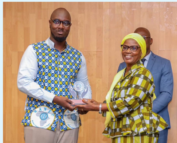
The National Coordinator of WANEP Côte d'Ivoire receives the third prize at the 2025 National Human Rights Awards in Côte d'Ivoire.

support and socio-economic empowerment, the project strengthened inclusive democracy, good governance and social cohesion. These interventions enabled 439 people from marginalised rural communities to obtain legal identity documents and sensitised over 500 individuals on civic engagement, enhancing political inclusion and contributing to the reduction of pre-election tensions. In recognition of these contributions, WANEP was awarded the third prize at the 2025 National Human Rights Awards in Côte d'Ivoire for its Democracy, Elections and Good Governance programme. This national recognition underscored the project's impact in advancing human rights, electoral inclusion and peaceful political participation.