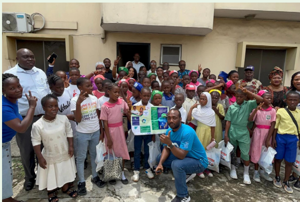
WANEP engages students and teachers under the Safe School Declaration Project in Lagos State, Nigeria.

In Nigeria, WANEP contributed to policy advocacy efforts aimed at strengthening the protection of students by engaging the Lagos State House of Assembly on the Safe School Declaration Bill. Through a targeted briefing with the Chairman of the House Committee on Education, WANEP strengthened legislative awareness and support for measures to improve the safety and security of schools across Lagos State. The positive reception of the Bill reflected growing political commitment to institutionalising safe schools within the state's education and protection framework.