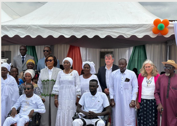
Launching ceremony of the project "Seeds for Peace" in Côte d'Ivoire

In Côte d'Ivoire, as part of the Seeds of Peace project , WANEP addressed the enduring impacts of the 2011 post-electoral crisis in Yopougon and Abobo, two densely populated communes of Abidjan that were among the most affected by the violence. The initiative combined victim-centred rehabilitation, symbolic reparation, psychosocial support and socio-cultural dialogue to promote recovery, reconciliation and collective remembrance. A total of 283 victims received integrated psychosocial, medical and economic support, including 200 community-based therapy sessions and income-generating activities, 88 per cent of which improved participants' economic conditions. Two symbolic actions and the inauguration of two memorial sites restored dignity to victims, strengthened trust and reinforced social cohesion. A joint review workshop consolidated lessons learned and enhanced the sustainability of community-level peacebuilding outcomes.