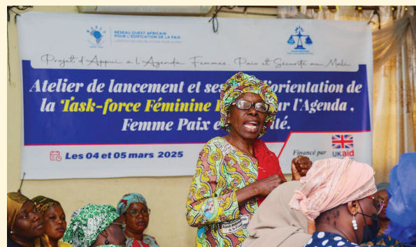
WANEP launches Local Women's Task Force for the Women, Peace, and Security Agenda in Mali.

In March 2025, WANEP established a Local Women's Task Force in Mali comprising 21 women leaders from six communes of Bamako. The Task Force was mandated to define roles, structure, and a strategic action plan to advance women's inclusion in local security governance. By creating a formal platform for leadership, the initiative strengthened women's agency in shaping community security priorities and enhanced their participation in local governance.