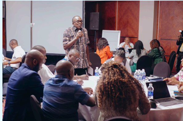
WANEP supports the development of practice guidelines to establish Zambia's National Peace Infrastructure.

Complementary activities included multistakeholder training on disaster risk reduction for 25 participants and the documentation of lessons learned. These efforts strengthened resilience, preparedness, and institutional capacity for conflict and crisis prevention. WANEP also provided technical support throughout the NPI development process, ensuring that the mechanism was inclusive, context-specific, and anchored in national structures.