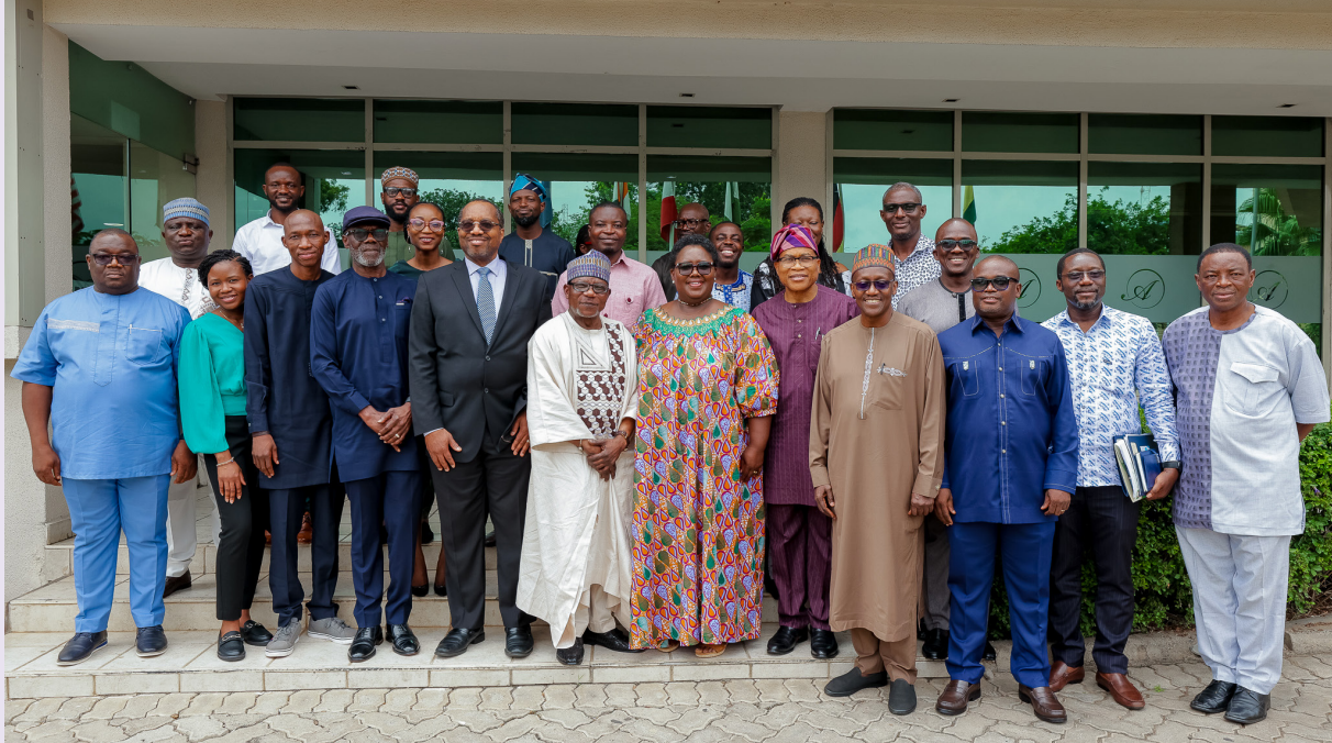
Cross-section of participants at the Policy Dialogue in Accra, Ghana