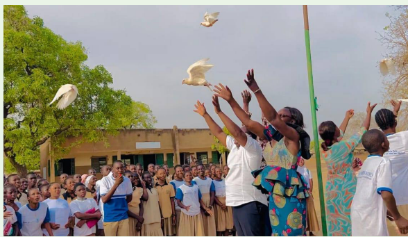
WANEP celebrates International Peace Day with Peace Club youth in Burkina Faso

To further amplify youth voices through creative and participatory approaches, WANEP trained 43 young people, including 21 young women, in forum theatre. This resulted in four youth-designed productions addressing harmful practices such as female genital mutilation, forced marriage, school exclusion, and stigma around teenage pregnancy, while also strengthening participants' confidence and public-speaking skills.