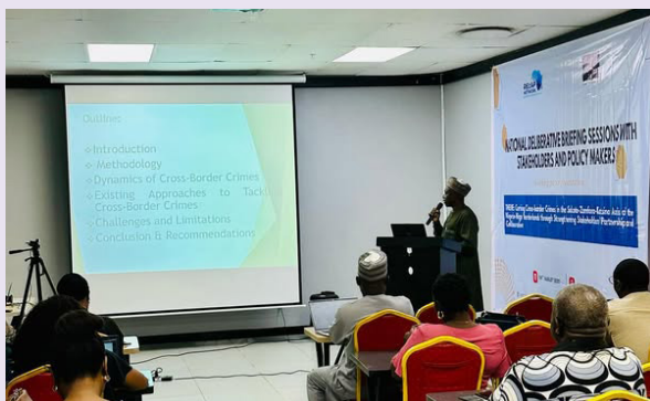
The REcAP Project strengthens civil society and peacebuilding in Nigeria (26 August 2025)