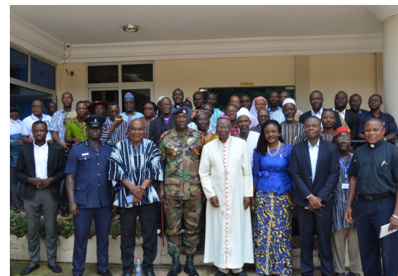
Cross section of participants at the launch of the Regional Election Early Warning and Response Group (REEWARG) in the Northern Region (Tamale)